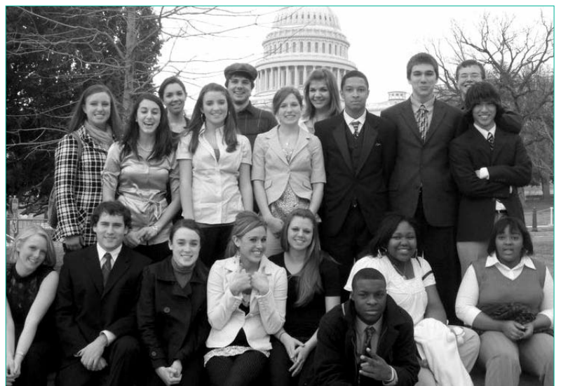
Student leaders from Northern's Student Senate and Central's Student Council pose in front of The Capitol during their recent visit to Washington, D.C.