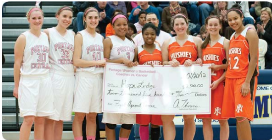
Team Members from Portage Central and Portage Northern Womens Team holding up the donation check in the amount of $2,500 for Hope Lodge

This year's $2500 donation will be going directly to "American Cancer Society Hope Lodge". It offers lodging and transportation to and from Grand Rapids cancer treatment centers free of charge. The "Pink Game" made local headlines with the Kalamazoo Gazette/Mlive.com with articles before and after the game.