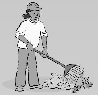
The fifth graders provided their labor to clean up the grounds in appreciation for APT'S help to pay for fifth grade camp.

The fifth grade clean-up took place on October 29th. The fifth grade cleanup committee joined forces with the Beautification Committee chaired by Patty Schuring to not just clean up, but add a little something special to the school grounds for spring! There was a lot accomplished by many children, including raking of the butterfly garden, weeding the basketball court, moving a picnic table and benches, raking the woodchips on the playground, cleaning up both courtyards, and preparing beds and planting tulip bulbs and lilacs on the south side of the school. Thanks to all the combined volunteers (listed below) from both committees!