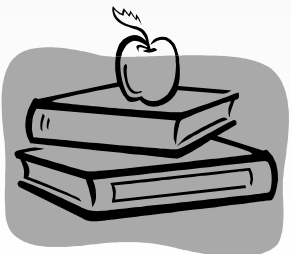
APT Notes & News is the Newsletter of the Amberly Parents and Teachers (APT) organization.