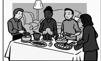
Speaking of oldies but goodies—Amberly's staff certainly appreciates the Annual Staff Luncheon!