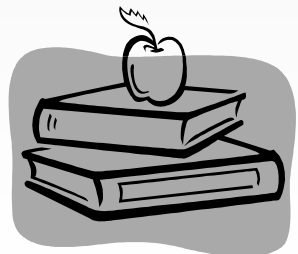
APT Notes & News is the Newsletter of the Amberly Parents and Teachers (APT) organization.