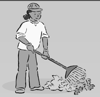
The fifth graders provided their labor to clean up the grounds in appreciation for APT'S help to pay for fifth grade camp.

The fifth grade clean-up took place on October 29th. The fifth grade cleanup committee joined forces with the Beautification Committee chaired by Patty Schuring to not just clean up, but add a little something special to the school grounds for spring! There was a lot accomplished by many children, including raking of the butterfly garden, weeding the basketball court, moving a picnic table and benches, raking the woodchips on the playground, cleaning up both courtyards, and preparing beds and planting tulip bulbs and lilacs on the south side of the school. Thanks to all the combined volunteers (listed below) from both committees!