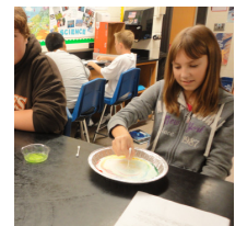
↓ Gum Lab