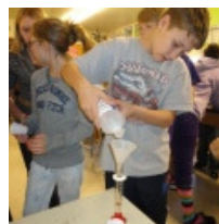
Meat Lab ↑

Sixth grade science focuses on the interactions of living things and their environment. The units help the students develop fundamental concepts in biology and ecology. Topics include interactions and relationships among ecosystems. In Science we are currently working on our ecology unit as well as performing the steps of the scientific method in various hands on labs. We are also monitoring our salmon tank closely as they have begun to hatch.